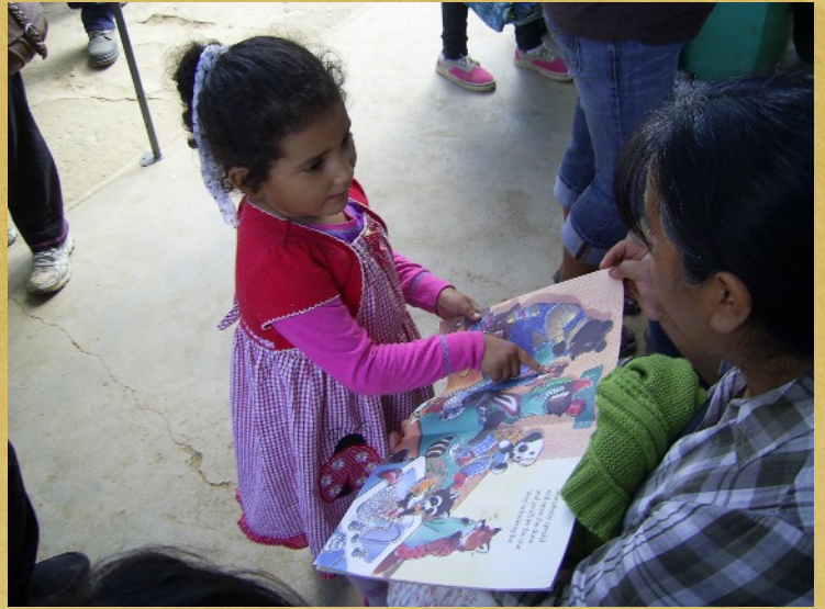
The books donated by the "Love, Talk, Read" organization have been a great hit with our younger patients.