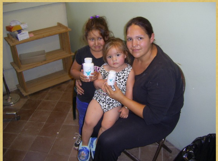
We are excited to be able to distribute pre and post natal vitamins provided at no cost by Vitamin Angels!