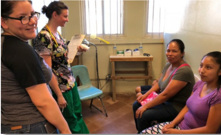
Our dedicated volunteers serving the local community