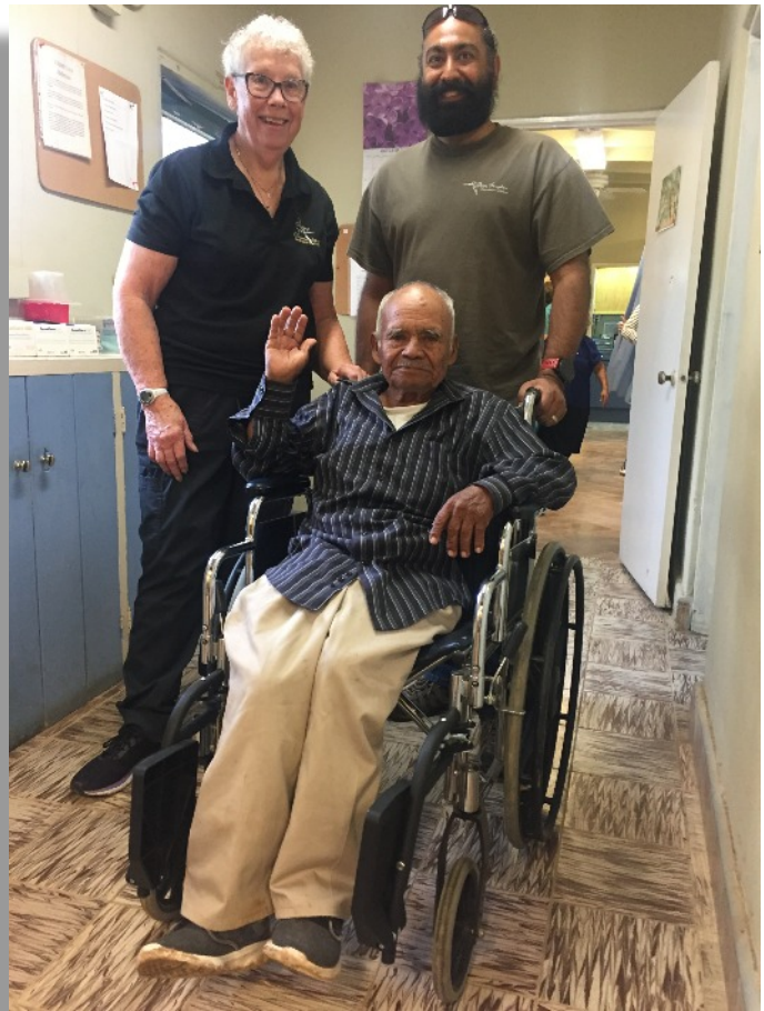
This 85-year old patient has been using crutches for more than 30 years. He is now enjoying better mobility in the first wheelchair he's ever owned.