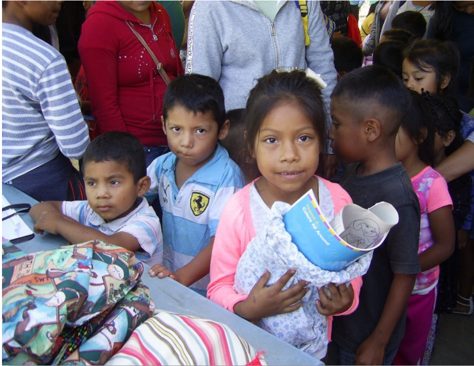
Dozens of families lined up to receive donated backpacks, clothing, school supplies and other donated items